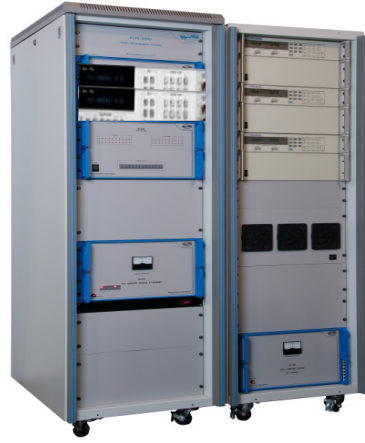
Calibration of both voltage and current output DCCTs