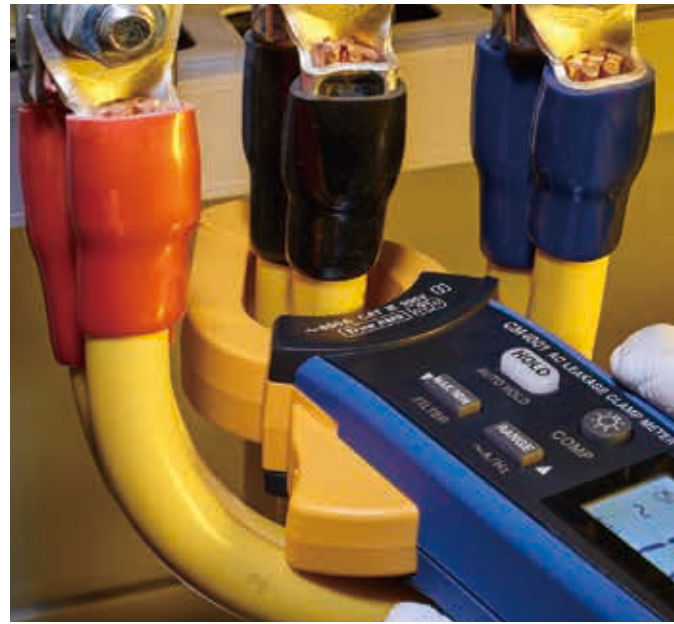
Clamp thick wires and double wires with narrow spacing smoothly