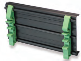
PDQ10, DIN-rail mounting adapter