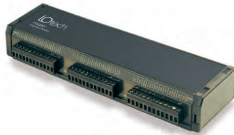
PDQ30, analog input expansion module