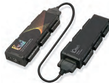
Personal Daq/3000 attached to a PDQ30 expansion module via a CA-96A cable

Unique to the Personal Daq/3000 Series is a low-latency, highly deterministic control output mode that operates independent of the PC. In this mode digital, analog, and timer outputs can respond to analog, digital, and counter inputs as fast as 2 \mu s; at least 1,000 times faster than other products that rely on the PC for decision making.