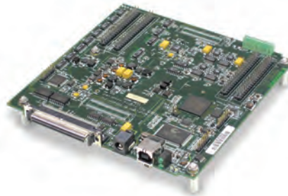
DaqBoard/3000USB, 16-bit/1-MHz USB data acquisition board