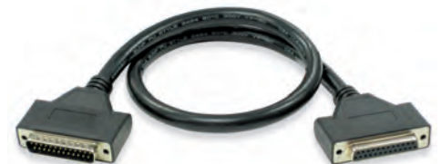
CA-96A, Personal Daq/3000 to PDQ30 cable