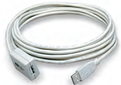
PDQ12, USB-powered extender cable