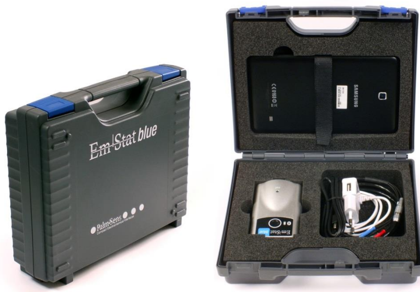
EmStat3 Blue in standard carrying case showing optional tablet