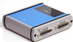
MUX8-R2 also available with integrated Emstat3 or 3+ potentiostat