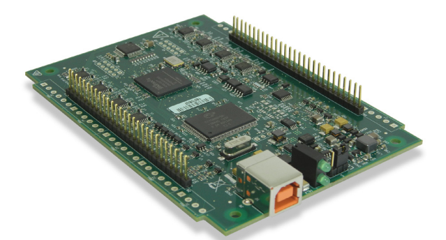
The OEM versions have the same specifications as the standard devices, but come in a board-only form factor with header connectors instead of screw terminals.

OEM versions have board-only form factors with header connectors for OEM and embedded applications (no case, CD, or USB cable included). All devices can be further customized to meet customer needs.