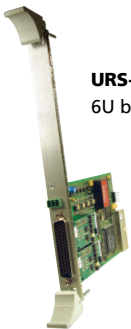
URS-1710-6U 6U bracket

Description of the functions see datasheet of the APCI-1710 page 166