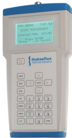
Figure 4 FTN02: CRU02 control and read out unit