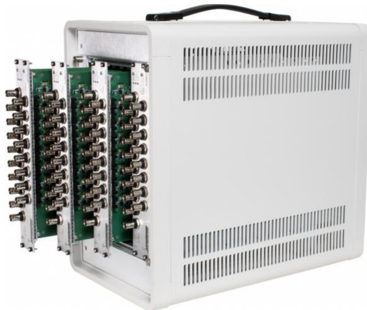
Figure 2. VIBbox-64 packages four DT9857E modules in a rugged enclosure for field use. The user can take advantage of the full expandability of this module series in a self-contained enclosure. The use of a USB hub internal to the system allows easy connection to the host computer through one simple USB cable. An external power supply is included.

VIBbox-64 supports four digital input ports and four digital output ports, the VIBbox-48 supports three digital inputs ports and three digital output ports, and the VIBbox-32 supports two of each. Each digital input port consists of 8 digital input lines and each digital output port consists of 8 digital output lines. Users can read all digital input lines or write to all digital output lines with a single-value digital I/O operation. Users can also return the value of the digital input ports in the analog input stream for synchronous input measurements, or update the value of the digital output ports in the analog output stream for synchronous waveform stimulus and control.