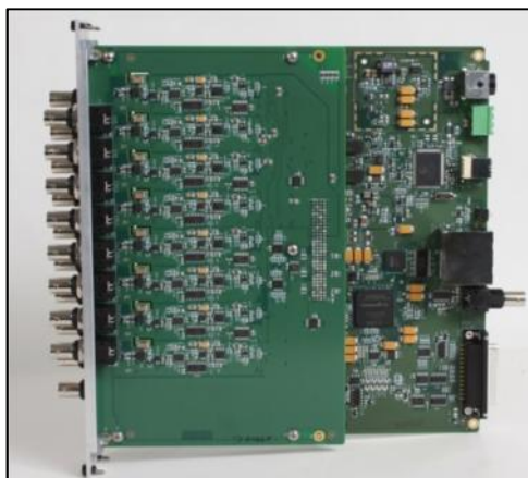
Figure 3. The DT9857E provides sixteen IEPE analog inputs, 2 analog outputs, 16 DIO, 1 C/T, 1 Tachometer, and 2 Measure Counters on each board set. VIBbox-64 packages four of these to bring the channel count to: 64 IEPE analog inputs, 8 analog outputs, 64 DIO, 4 C/T, 4 Tachometers, and 8 Measure Counters. For more information on the DT9857E module, visit our web site: http://www.datatranslation.com/products/dataacquisition/usb/DT9857E/