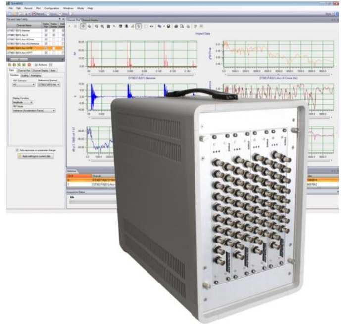
Figure 1. VIBbox-64 offers high-accuracy measurement on 64 IEPE channels, making it ideal for large channel count applications that require noise, vibration, and acoustic measurements. QuickDAQ with Advanced FFT Analysis and the Signal Processing Component Library for .NET software are included at no charge to get you up and running quickly.