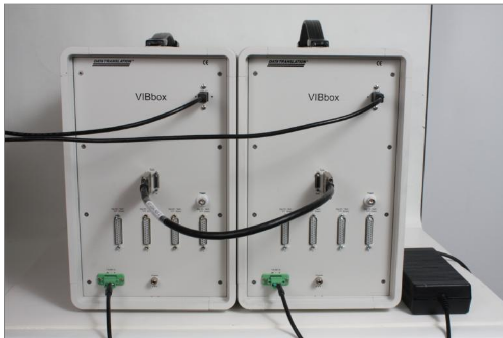
Figure 4. Multiple VIBboxes can be connected together (two VIBboxes shown here) using one or more EP377 Trigger Bus cables. Each VIBbox must be powered using an external power supply and connected to the USB 3.0 port of the host computer.

The DT Device Collection Manager, provided on the OMNI CD with the VIBbox, allows all the channels from each VIBbox to be combined into one collection, enabling the software to work seamlessly with all channels for maximum ease of use.