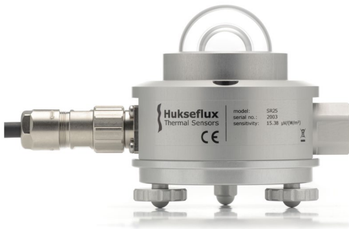
Figure 3 SR25 pyranometer with its sun screen removed

SR25 measures the solar radiation received by a plane surface, in W/m^2 , from a 180^\circ field of view angle. SR25 offers the best measurement accuracy: the specification limits of two major sources of measurement uncertainty have been greatly improved over competing pyranometers: "zero offset a" and temperature response.