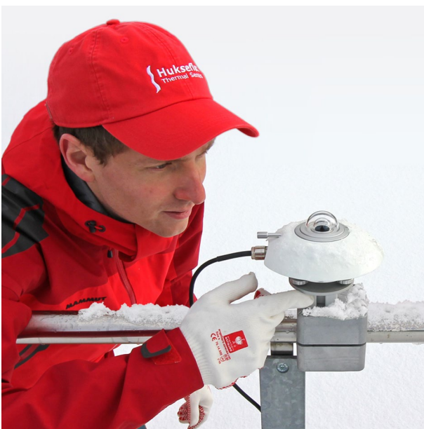
Figure 4 SR25 accelerating sublimation of snow, here shortly after snowfall

SR25 has a sapphire outer dome, glass inner dome and an internal heater. It employs a state-of-the-art thermopile sensor with black coated surface and an anodised aluminium body. The connector, desiccant holder and sun screen fixation are very robust and designed for long term use.