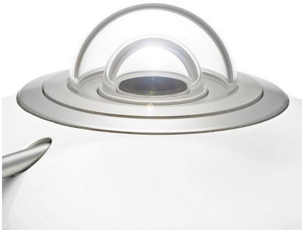
Figure 6 SR25's sapphire outer dome takes solar radiation measurement to the next level