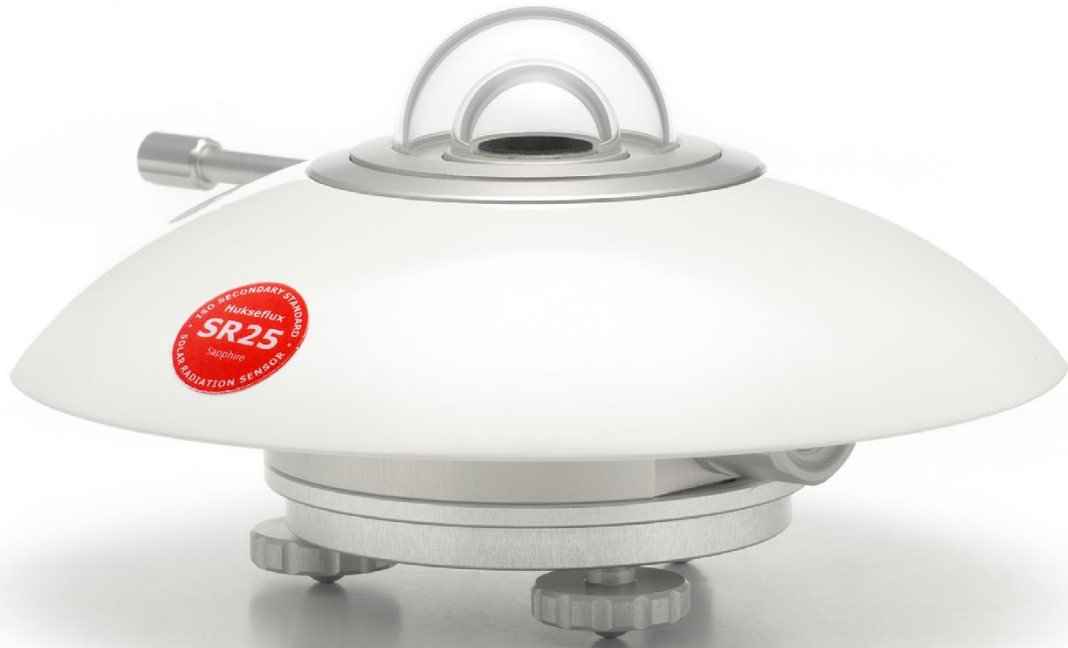
Figure 1 SR25 secondary standard pyranometer

SR25 takes solar radiation measurement to the next level. Using a sapphire outer dome, it has negligible zero offsets. SR25 is heated in order to suppress dew and frost deposition, maintaining its measurement accuracy. When heating SR25, the data availability and accuracy are higher than when ventilating traditional pyranometers. SR25 needs very low power. Patents on the SR25 working principle are pending.