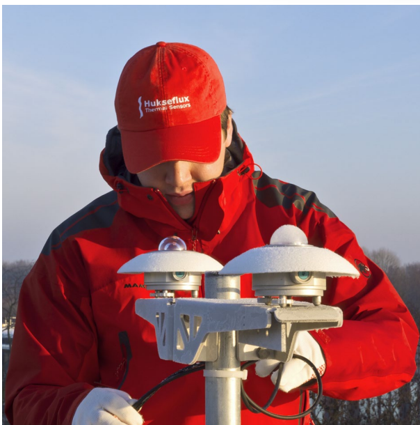
Figure 2 frost deposition: clear difference between SR25 (left), versus a non-heated pyranometer without sapphire dome (right)