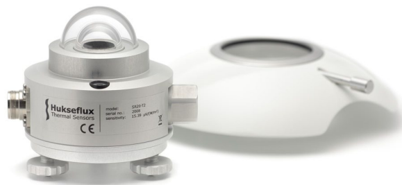
Figure 4 SR20 with its sun screen removed

The uncertainty of a measurement under outdoor conditions depends on many factors. Guidelines for uncertainty evaluation according to the "Guide to Expression of Uncertainty in Measurement" (GUM) can be found in our manuals. We provide spreadsheets to assist in the process of uncertainty evaluation of your measurement.