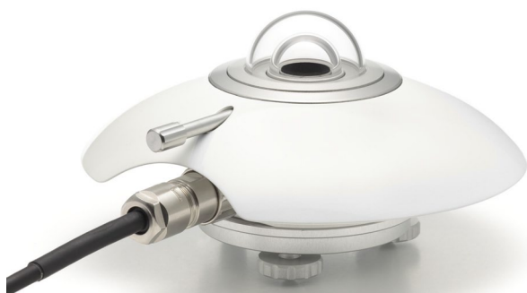
Figure 5 SR20 side view