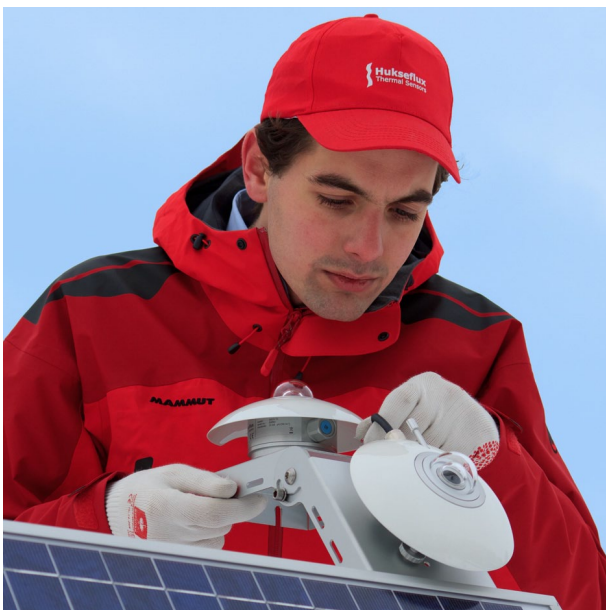
Figure 2 dual setup in PV system performance monitoring