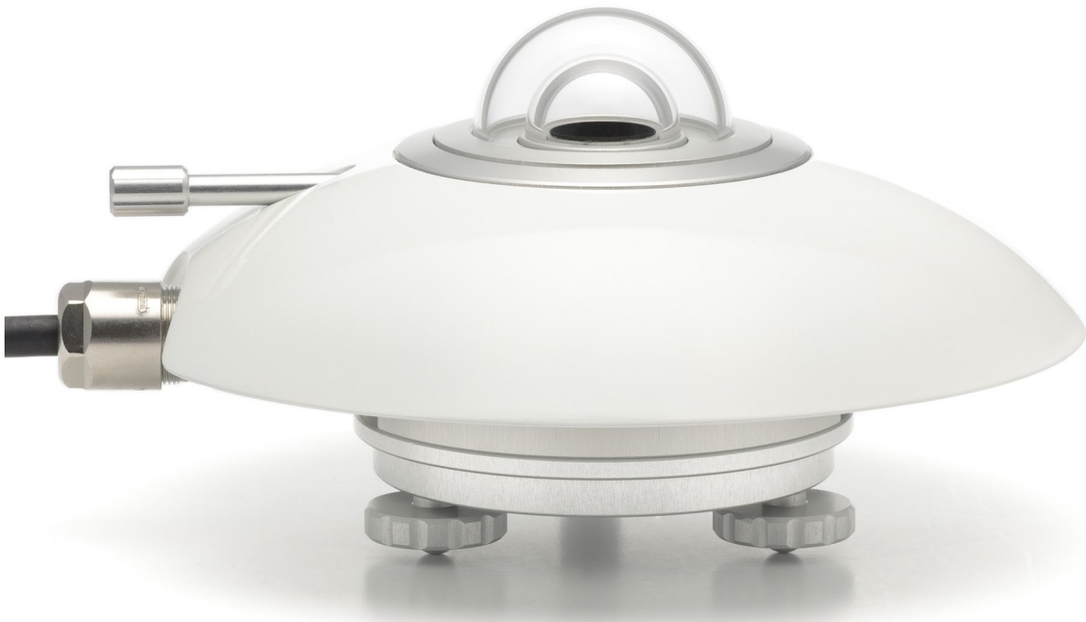
Figure 1 SR20 secondary standard pyranometer

SR20 is a solar radiation sensor of the highest category in the ISO 9060 classification system: secondary standard. SR20 pyranometer should be used where the highest measurement accuracy is required.