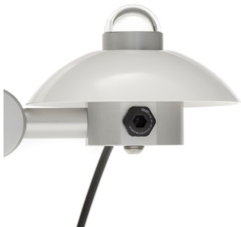
Figure 4 RA01 2-component radiometer in detail

Applicable instrument-classification standards are ISO 9060 and WMO-No.-8; Guide to Meteorological Instruments and Methods of Observation.