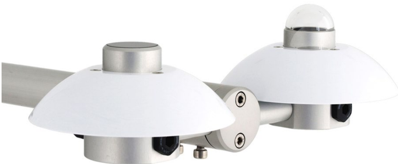
Figure 1 RA01 2-component radiometer

RA01 is a 2-component radiation sensor that is used for scientific-grade energy balance and surface flux studies. It offers separate measurements of solar and longwave radiation. When combined with estimates of solar albedo and of local surface temperature, this instrument can also be used for estimation of net radiation. The advantages of this approach are cost reduction and independence from local surface properties.