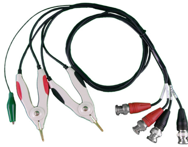
Kelvin Test Leads