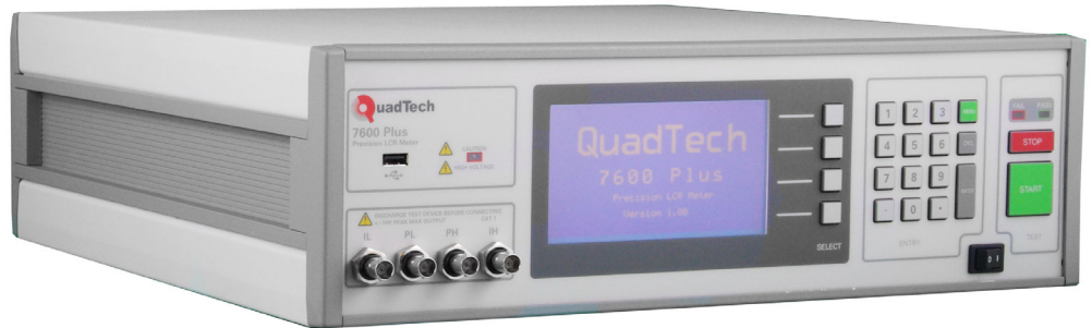
7600 Plus Precision LCR Meter

The 7600 Plus LCR meter performs precision impedance measurement over a frequency range of 10 Hz to 2 MHz. This instrument can measure 14 different impedance parameters with 0.05% accuracy, meeting today's requirements for component and material testing. User-friendly menu-driven programming makes the 7600 Plus ideal for applications in product development, incoming inspections, and production-line testing.