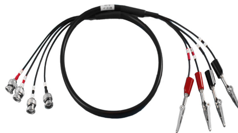
Alligator Clip Leads