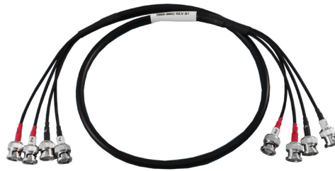
bnc-bnc Extender Cable, 1 m bnc-bnc Extender Cable, 2 m