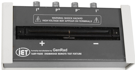
Remote Test Fixture