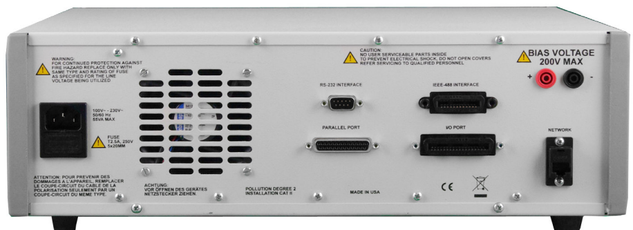
7600 Plus Rear Connectors

To ensure that the 7600 Plus is easy to operate, the unit offers a large LCD display and a user-friendly, menu-driven interface.