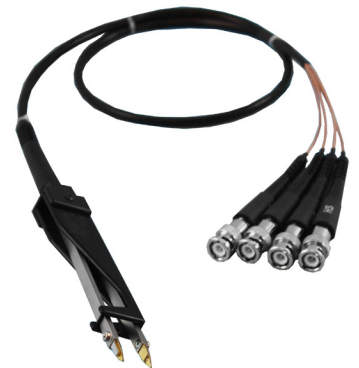
Chip Component Tweezers