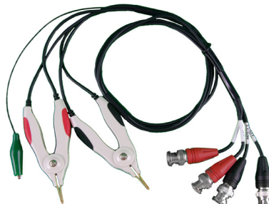
Kelvin Test Leads