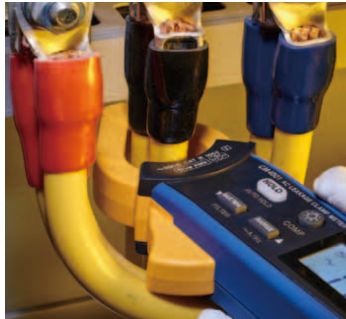
Clamp thick wires and double wires with narrow spacing smoothly