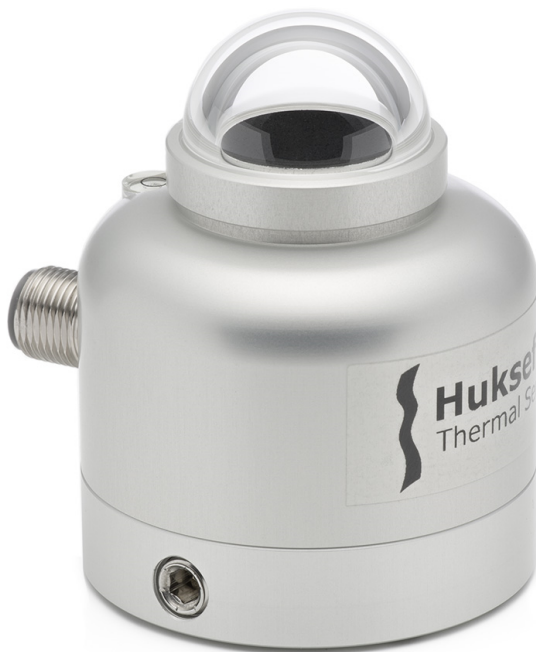
Figure 1 SR05-D1A3-PV pyranometer

SR05 series is the most affordable range of pyranometers meeting ISO 9060 requirements. These sensors are ideal for general solar radiation measurements and popular for monitoring PV systems. Model SR05-D1A3-PV is made as a perfect alternative to PV reference cells. It offers the same Modbus interface as the most common PV reference cell model for easy compatibility. Relative to PV reference cells, SR05-D1A3-PV has the advantage of higher stability, independence of the PV cell type or anti-reflection coating, and better availability and price of recalibration.