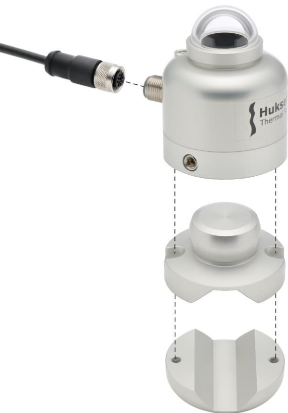
Figure 3 'Exploded view' of SR05-D1A3-PV. The optional ball levelling and tube mount allow for easy installations. The cable (standard 3 m) has an M12-A connector.

SR05 pyranometers employ a thermopile sensor with black coated surface, one dome and an anodised aluminium body with visible bubble level. Optionally the sensor can be delivered with a unique ball levelling mechanism and tube mount or dedicated mounting fixture, for easy installation. SR05-D1A3-PV has an industry standard digital output: Modbus RTU over half-duplex RS-485, that allows multiple sensors to be installed on a single network. In addition, SR05-D1A3-PV has analogue 0-1 V output.