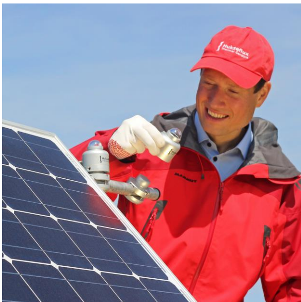
Figure 2 SR05's, one in PoA, replacing PV reference cells