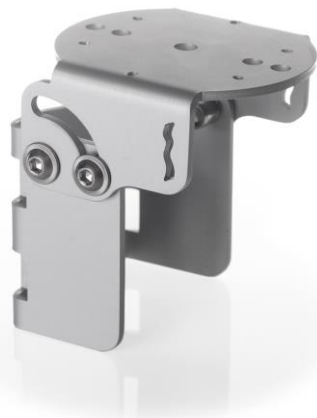
Figure 5 PMF01 mounting fixture accessory: practical, small footprint, and allowing horizontal and plane of array installations on various platforms