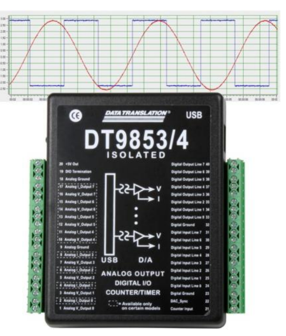
Figure 1. The DT9853/54 provides waveform streaming at up to 8kHz on one channel, ideal for process control, control loop, and test applications.