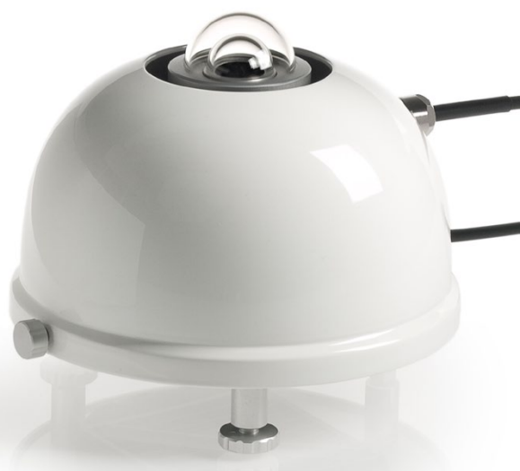
Figure 1 VU01 ventilation unit with pyranometer SR20

VU01 is a high-quality ventilation unit for use with pyranometers and pyrgeometers. Its purpose is to improve the dependability of the measurement. Measurement accuracy improves because offsets are reduced. Reliability benefits from prevention of dew and frost formation and quick evaporation and sublimation of water and snow. ISO/TR 9901 "Solar Energy - Field Pyranometers - Recommended practice for use" recommends use of ventilators where high accuracy and reliability are required.