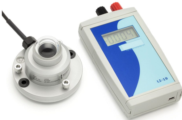
Figure 1 LP02 pyranometer with LI19 handheld read-out unit / datalogger

LP02 is a solar radiation sensor that is applied in most common solar radiation observations. LP02 complies with the second class specifications of the ISO 9060 standard and the WMO Guide. LI19 is a high accuracy handheld read-out unit / datalogger. The LP02 - LI19 combination is well suited for mobile measurements and short term datalogging.