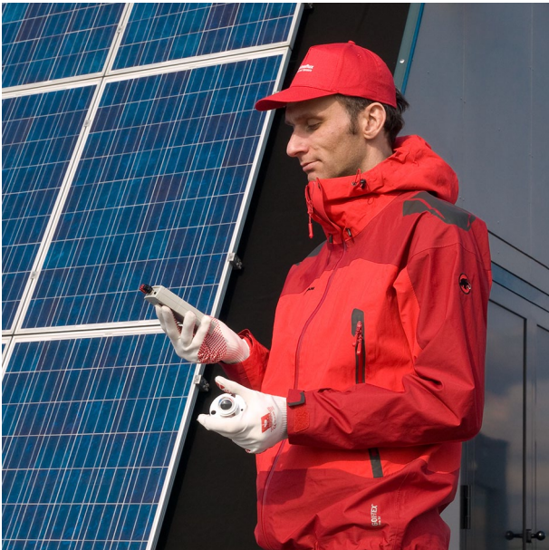
Figure 4 LP02-LI19 used in field measurement campaign