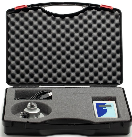
Figure 2 LP02-LI19 as it is delivered, in a practical transport case