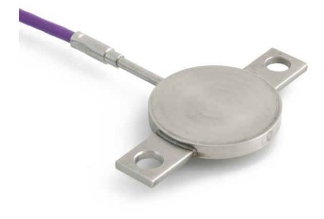
Figure 1 HF05 industrial heat flux sensor