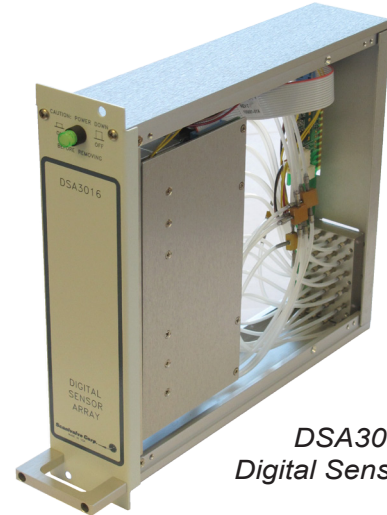
DSA3016/16Px Digital Sensor Array

The DSAENCL4000 uses a micro SD card to store all configuration and module data. The SD card is easily removed if needed for security reasons. The enclosure utilizes a pressure temperature look-up table to compensate the pressure sensors for temperature changes, effectively negating any thermal errors.